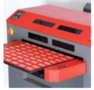
iUV-600s - Print area A2+ iUV-1200s - Print area A0-