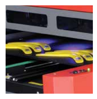
Dual water cooled LED lamps. 395Nm low heat