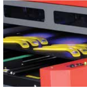
Dual water cooled LED lamps. 395Nm low heat