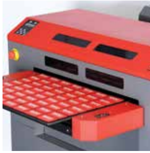
iUV-600s - Print area A2+ iUV-1200s - Print area A0-