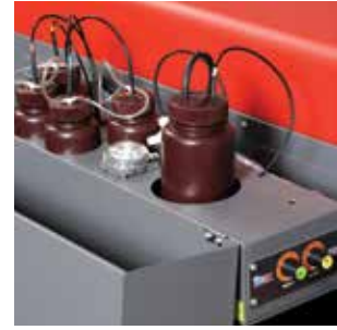
Bulk ink system with WIMS® ink circulation and filtration

Head features 1440 nozzles capable of delivering a fine dot for ultra fine dot placement. When configured with Clear, our 1150mm wide print width delivers 1400 dpi at high speed with remarkable color brilliance. Max print area (A2+) with an adjustable media height to 300mm (the highest in its class).