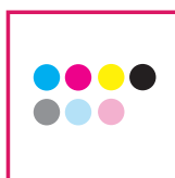
CMYK + Lc, Lm & Lk