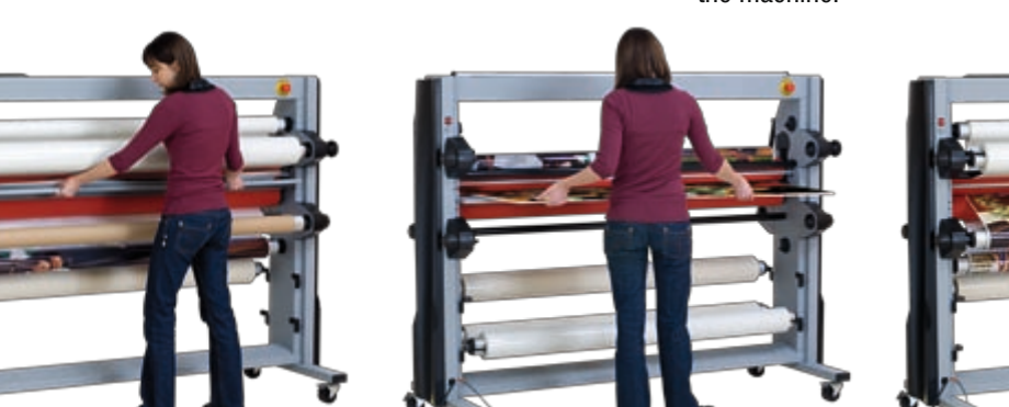
Storage of up to 4 film rolls easily reachable under the laminator.

Installed, it maintains the board flat after passing through the rollers. Removed, the prints can be rewound perfectly onto the roll take-up.